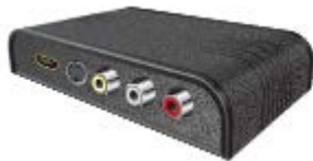
CVBS/S-Video to HDMI Converter