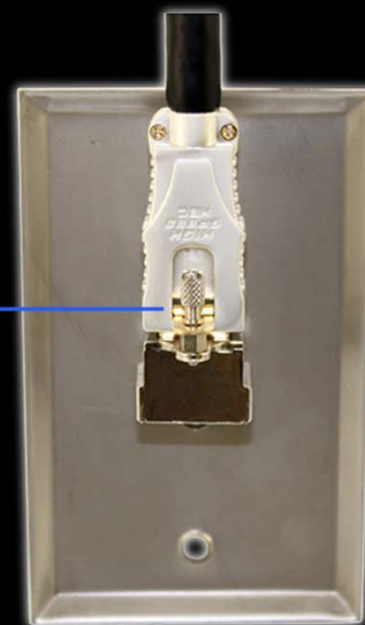
Rear Wall Plate